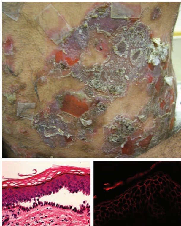
Figure 1. Diagnosis of pemphigus vulgaris. Wide-spread skin blisters and crusted erosions cause pain, itching, and risk of infection (top). Diagnosis of PV is based on histology, which shows a classic “row of tombstones,” representing loss of basal keratinocyte adhesion from suprabasal keratinocytes (bottom left), and immunofluorescence analysis of patient skin or serum samples, which documents binding of autoantibodies to the keratinocyte cell surface (bottom right). \times 400 magnification for bottom panels.